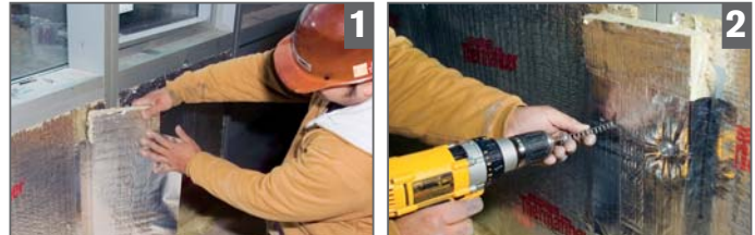
Place mullion cover over the vertical spandrel.