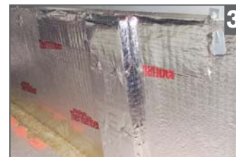
Tape over all spiral anchors to restore vapor barrier with Thermafiber® Aluminum Foil or FSK tape.