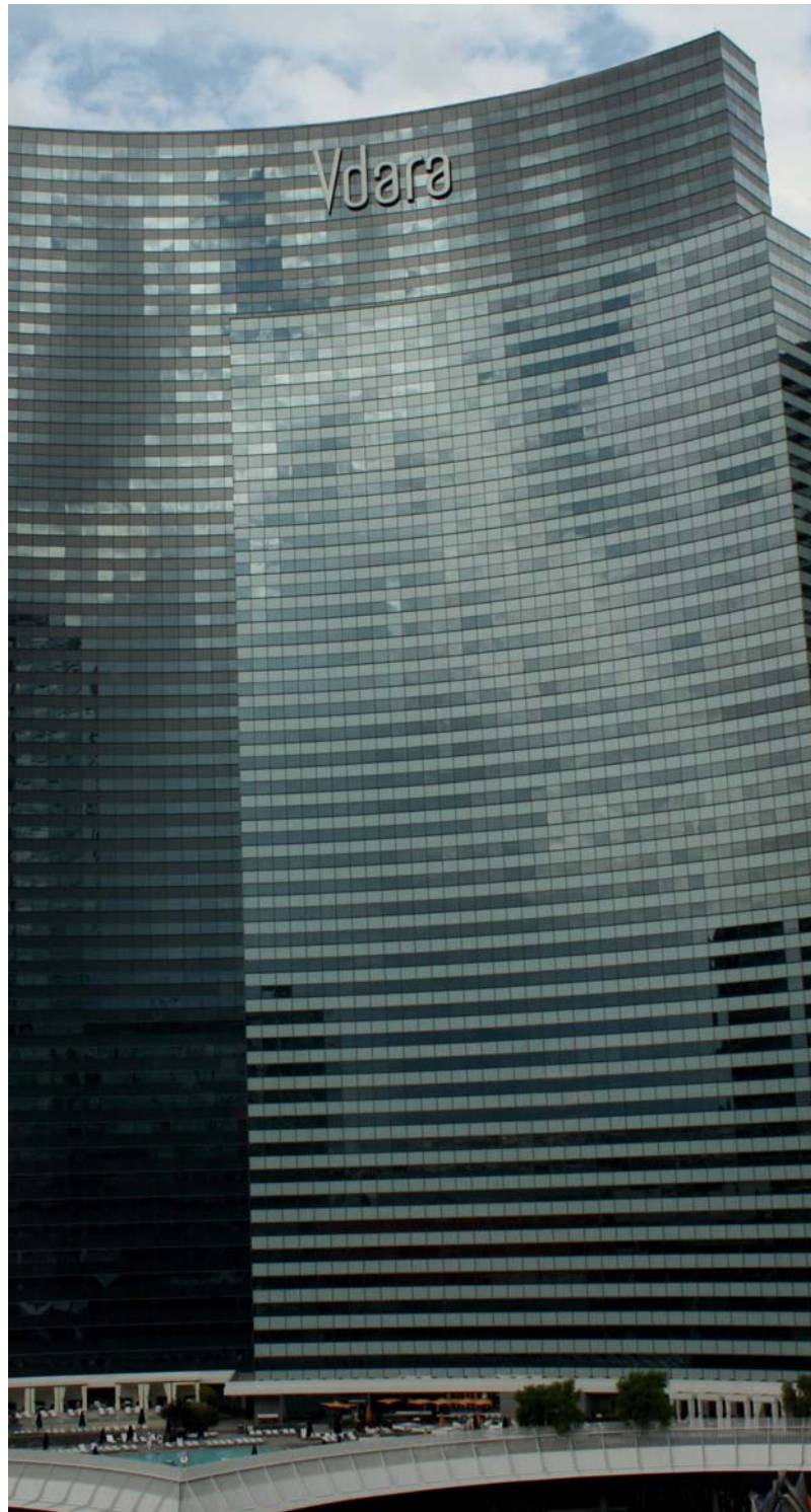
Spiral Anchors in conjunction with Thermafiber ® Impasse ® Insulation Hangers were used in the perimeter fire containment system in the Vdara Hotel in Las Vegas, NV.

Job Name _____ Contractor _____ Date _____