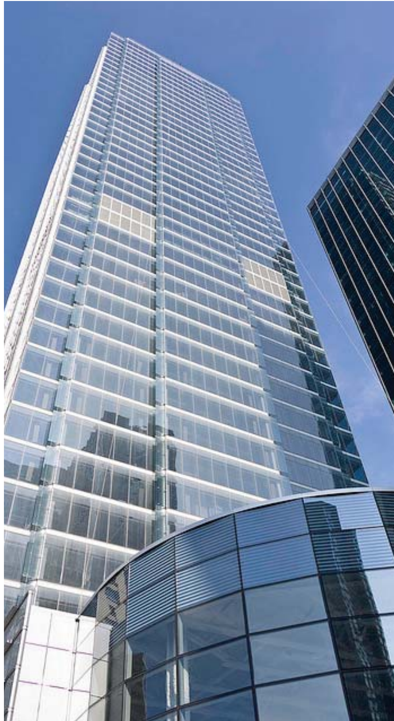
The Thermafiber® Impasse® Insulation Hanger System was used to install various Thermafiber® mineral wool products in the perimeter fire containment system at 353 N. Clark in Chicago, IL. Thermafiber® mineral wool insulation contributed to this building's LEED® Gold status.

Job Name _____ Contractor _____ Date _____